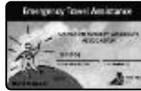
World Access card